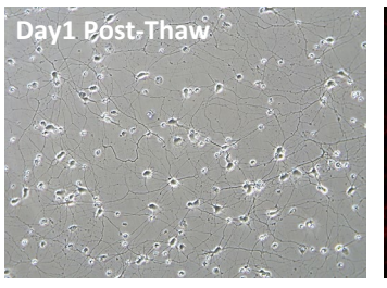
Figure 1: Typical Results from RealMOTO

Perform counterstain and antibody dilutions in Blocking Buffer